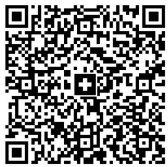
Banque Cantonale de Genève CH26 0078 8000 0510 7337 8

By bank transfer: Using the banking app on your phone, scan one of the QR codes below: