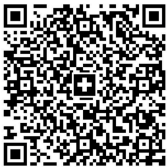
Post Finance CH13 0900 0000 1200 9677 6

By cash: Place your contribution in the offering bags during worship. By U.S. dollar check: Make the check payable to “Evangelical Lutheran Church in America,” and on the memo portion, write “GMG 0858”.