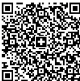
Post Finance CH13 0900 0000 1200 9677 6