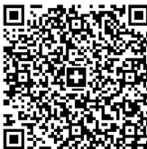
Post Finance CH13 0900 0000 1200 9677 6