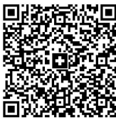
Banque Cantonale de Genève CH26 0078 8000 0510 7337 8

By bank transfer: Using the banking app on your phone, scan one of the QR codes below: