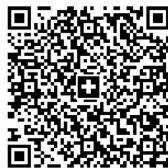
Post Finance CH13 0900 0000 1200 9677 6

By cash: Place your contribution in the offering bags during worship. By U.S. dollar check: Make the check payable to “Evangelical Lutheran Church in America,” and on the memo portion, write “GMG 0858”.