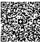
Banque Cantonale de Genève CH26 0078 8000 0510 7337 8

By bank transfer: Using the banking app on your phone, scan one of the QR codes below: